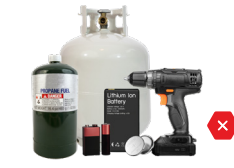
NO Batteries, Power Tools, Flammables or Hazardous Waste