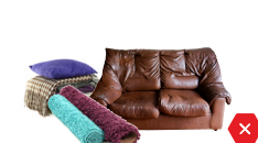
NO Clothing, Furniture or Carpet