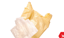
NO Loose Plastic Bags, Bagged Recyclables or Film

Empty recyclables directly into your bin