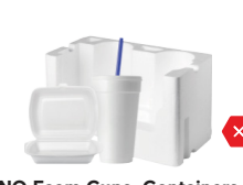
NO Foam Cups, Containers or Straws