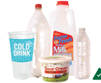
Plastic Bottles, Cups & Containers