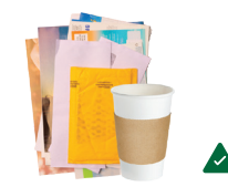
Paper & Paper Cups